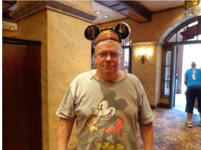
Funny hat payback picture #1

Re-entry to HS was without difficulty and we headed directly to TOT for ride #2. Again, without a Fastpass, the wait was minimal and the ride with very good. NHshorty found some cool Mickey Ears in the TOT gift shop. Here I am trying to give a TOT CM stern look while looking like an idiot.