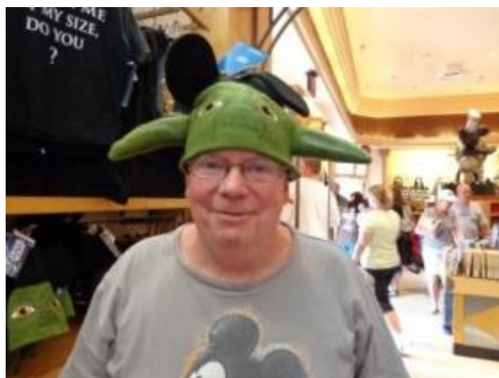
Funny hat payback picture #2

By this time Fantasmic had already started, and we were pretty tired, so we headed back down Hollywood Boulevard and hit a few of the shops. Here I am trying on a combination Yoda and Mickey ears hat. Payback is a female dog in heat.